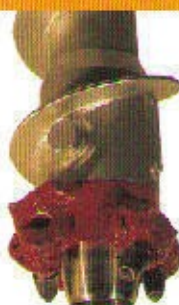
Sampler extended for soft material