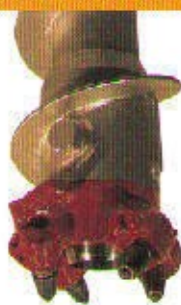
Sampler retracted for hard material

The positioning is accomplished through an adjustment rod that connects the sampler to the hex rods. A drive pin locks the parts together at the desired length. Adjustments are available in one inch (2.5 cm) increments.